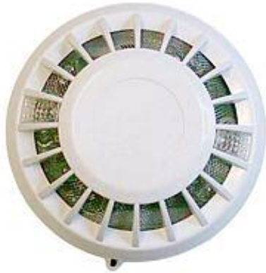
Order Code 500-900

This product offers a very high quality smoke detection solution for systems designed around security control panels.