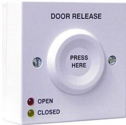
Touch switch for access control

Input terminals for fire system interfacing and additional conventional push buttons