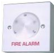
Order Code 500-420