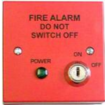
Order Code 400-210R (RED) Order Code 400-210W (White)

Mains voltage isolation switch suitable for use with fire alarm systems. Secure lockswitch (authorised person only) 4A Double pole switch. See BS5839 Pt.1 2002 section 29.2