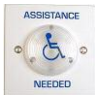
Order Code 500-400