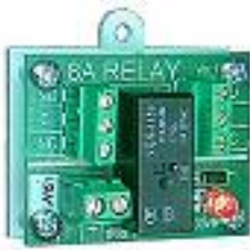
order code 500-010

EASY RELAY makes alarm interfacing fast and efficient. Built-in series diodes for bell circuits. LED indicator for activation confirmation. No more sticky pad feet to mess about with , just a single screw fixing. The plastic bases are colour coded. Available in 12V, 24V and 240VAC trigger coils.