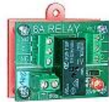
order code 500-020

Easy Relay 12V Order code 500-010 Ideal for Security Systems (compact size) safe and simple mounting plate, LED indicator 12V Coil and two 8A changeover contacts