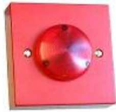
Order Code 500-410

Modern low profile sounders with integral LED beacon. Low Current electronics, flame retardant plastic. Suitable for use in fire alarm systems and call systems.