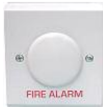
Order Code 500-450 RED:500-450R