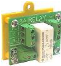
order code 500-050

Easy Relay 24V Order code 500-020 Ideal for Fire Systems (compact size) safe and simple mounting plate, LED indicator 12V Coil and two 8A changeover contacts