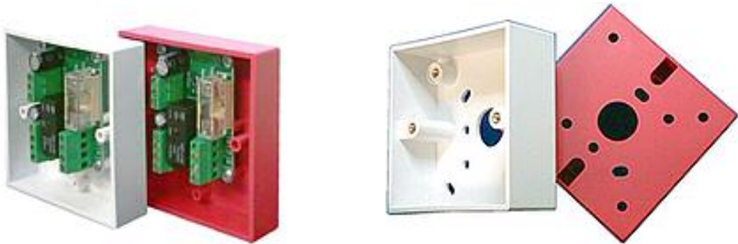
Order Code 500-0002 (RED) Order Code 500-0002 W (White)

Supplied in Red or White complete with matching backbox.