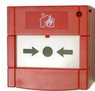
Order Code 500-950

Supplied with reset key. Suitable for use with any conventional 24V fire alarm panel.